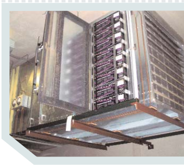
PURAFIL SIDE ACCESS SYSTEM AT THE UNIVERSITY OF GEORGIA JOURNALISM BUILDING, ATHENS, GEORGIA